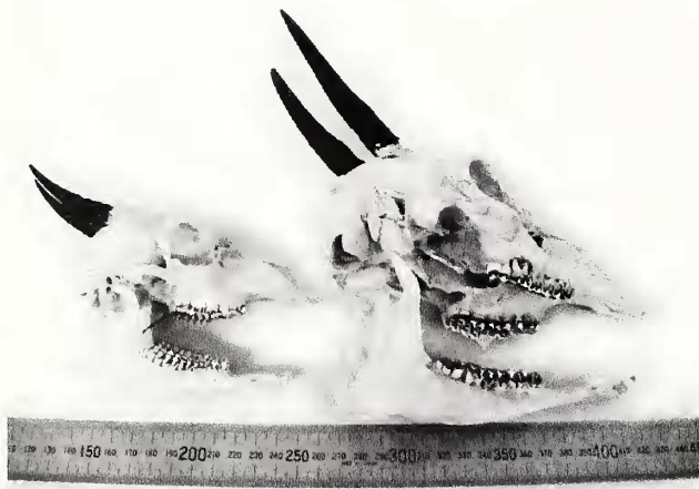
Figure 1. The skulls of blue duiker (left) and common duiker (right).

Eleven skulls from each of the two duiker species,